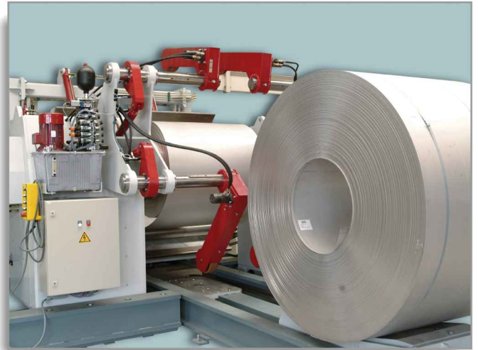
Detailed view of coil reel and loading system