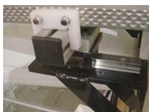
TRAY MOUNTING AT TRANSPORTER END WITH CLAMPING KIT